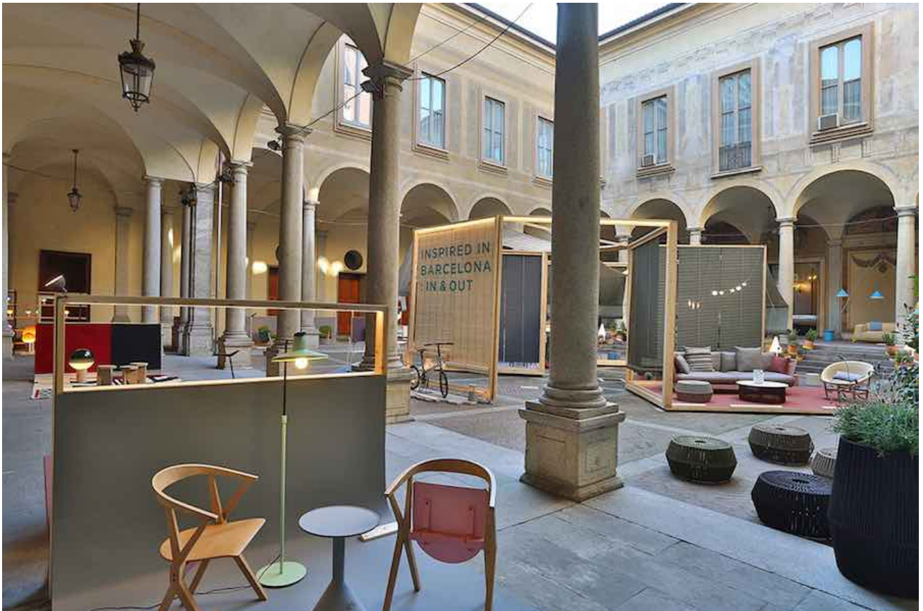
Inspired in Barcelona: In and Out

ANDREU CARULLA BARCELONA BD BARCELONA CATALONIA CONSTANTIN GRIC DESIGN EMILIANA DESIGN STUDIO EUGENI QUITLLET FURNITURE KETTAL LAGRANJA DESIGN LIVINGTINGS MARTÍN AZÚA MILAN 2017 MUT DESIGN NANIMARQUINA OUTDOOR PARACHILNA SPAIN VIBIA XAVIER MOREA